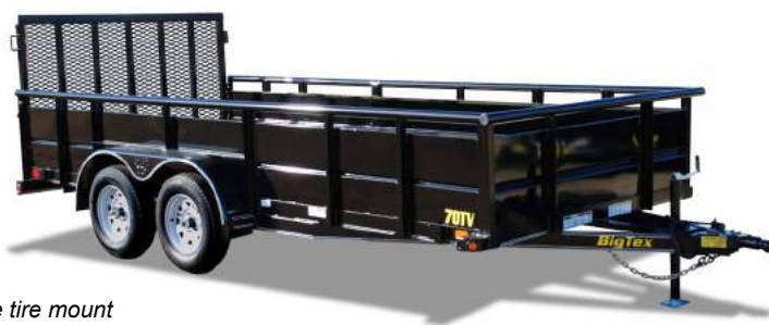
Shown with optional rampgate and spare tire mount